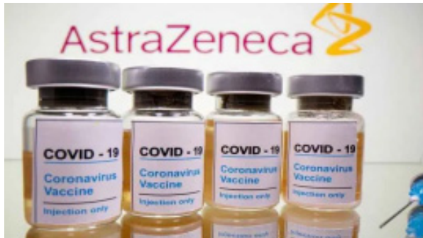
GNS News Agency, May 10

New Delhi: In a significant move, pharma giant AstraZeneca has recalled its Covid-19 vaccine, made in collaboration with Oxford University, worldwide, months after admitting in the UK court about its potential rare blood clot side effect. The company voluntarily withdrew its "marketing authorisation" of its Covid vaccine, sold as Covishield in India and Vaxzevria in Europe. It can now no longer be used in the European Union, the Telegraph reported. While the company made the application to withdraw the vaccine on March 5, it came into effect on Tuesday. Credited for saving more than six million lives, AstraZeneca "accepted, in a legal document submitted to the High Court in February, that its Covid vaccine 'can, in very rare cases, cause TTS'," the report said.