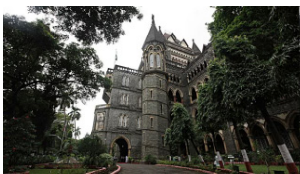
May 10