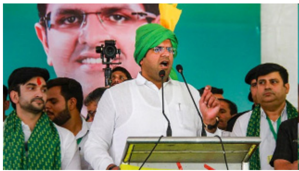
GNS News Agency, May 10

A day after three Independent MLAs withdrew support from the Nayab Saini-led BJP government in Haryana and extended support to the Congress, former deputy chief minister and Jannayak Janta Party (JJP) leader Dushyant Chautala said on Wednesday that he would "support Leader of Opposition Bhupinder Singh Hooda" if the latter initiates a move to topple the state government. "The BJP is talking of winning all 10 Lok Sabha seats and one seat of Karnal bypoll. But three MLAs withdrawing support shows how weak the BJP has become. I would also like to tell Leader of Opposition that according to the mathematics of numbers today, if a step is taken to topple this government during elections, I would thoroughly consider supporting him [Hooda] from outside. It is now for Congress to think if it will take a step to topple the BJP government," Chautala said, days before Haryana is set to vote in the Lok Sabha elections on May 25.