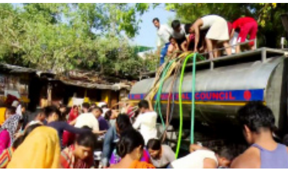
June 12

The Supreme Court on June 12 came down heavily on the Delhi Government over the prevalence of tanker mafia and water wastage in the city, and asked what measures it has taken against them. A vacation Bench of Justices Prashant Kumar Mishra and Prasanna B. Varale told the Delhi Government that if it can't deal with tanker mafia, it will ask the Delhi Police to take action in the matter.