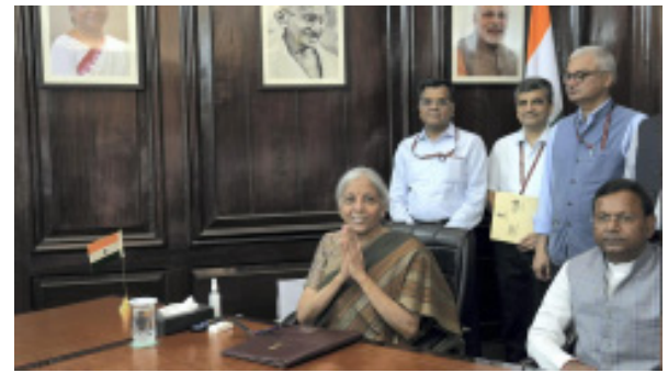
GNS News Agency, June 12

Reforms to boost growth and stability will continue, asserts Nirmala Sitharaman after assuming charge as Finance Minister