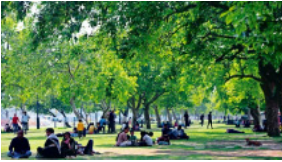
GNS News Agency, June 24