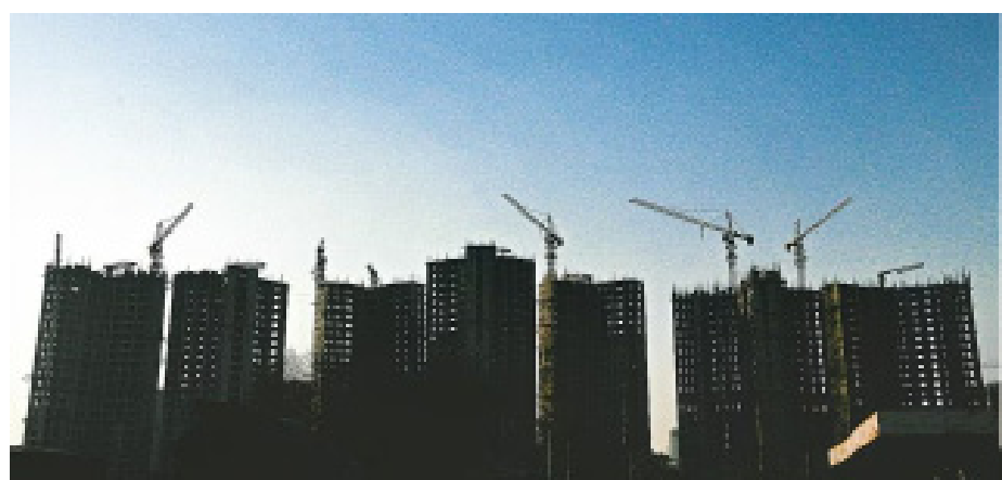
GNS News Agency, June 24

Trouble may be in store for two prominent builders with the Yamuna Expressway Industrial Development Authority (YEIDA) planning to cancel the allotment of their plots as they have not submitted their land dues despite getting relief under the Amitabh Kant package. Officials said that ATS Realty Private Limited and Supertech Township Project Limited have not paid their dues despite multiple chances.