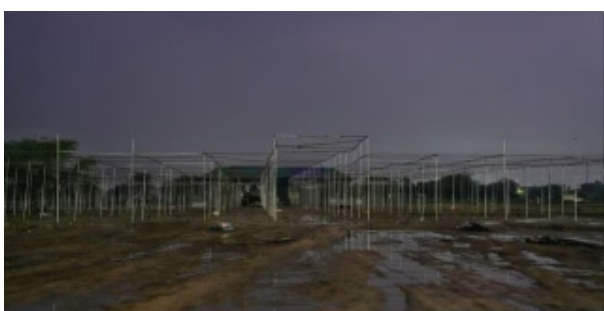
GNS News Agency, July 9

A massive stampede took place during a ‘satsang’ (religious congregation), in Sikandara Rao area in Hathras district, Wednesday, July 3, 2024. (Express Photo) A massive stampede took place during a ‘satsang’ (religious congregation), in Sikandara Rao area in Hathras district.