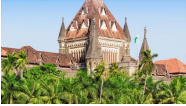
July 9

The court also sought affidavits from the BMC and police on steps taken in the last two years for removing illegal and unlicensed hawkers or street vendors and posted further hearing to July 22. The Bombay High Court has recently observed that unauthorised hawkers and street vendors have “virtually taken over street lanes and bylanes” in Mumbai with “no place for people to walk on footpaths”.