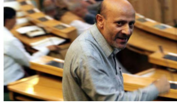
July 9

The Election Commission has sent a notice to newly elected MP Sheikh Abdul Rashid, also known as Engineer Rashid who is in jail in a terror funding case, over a significant disparity in his election expenditure report for the Baramulla Lok Sabha constituency in Jammu and Kashmir.