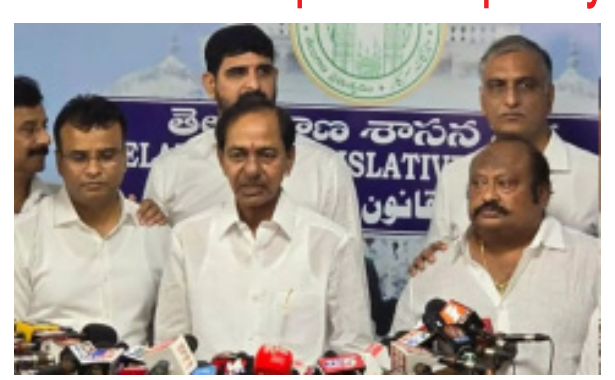
July 25

Following the introduction of the Telangana budget by Finance Minister and Deputy Chief Minister Mallu Bhatti in the Assembly today, BRS chief K. Chandrashekar Rao (KCR) expressed his discontent with the state's financial plan, labeling it as "far from reality.