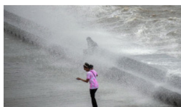
GNS News Agency, July 25