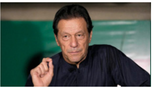
GNS News Agency, July 25