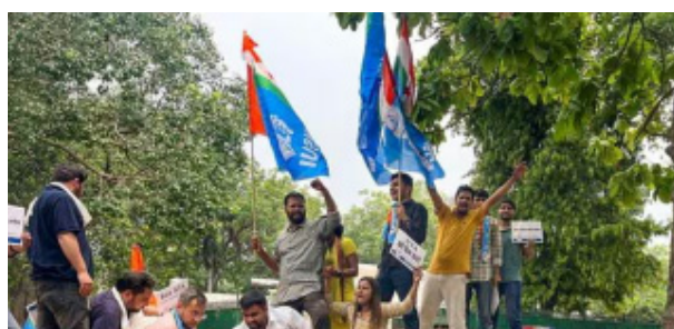
GNS News Agency, July 26

The Trinamool Congress Wednesday moved a resolution in the Assembly condemning the National Eligibility cum Entrance Test (NEET), and demanding that the Joint Entrance Examination (JEE) be reinstated in West Bengal.