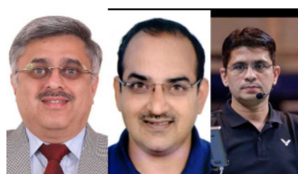
GNS News Agency, July 26