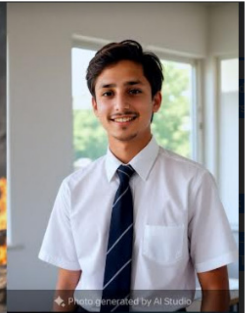
Photo generated by AI Studio