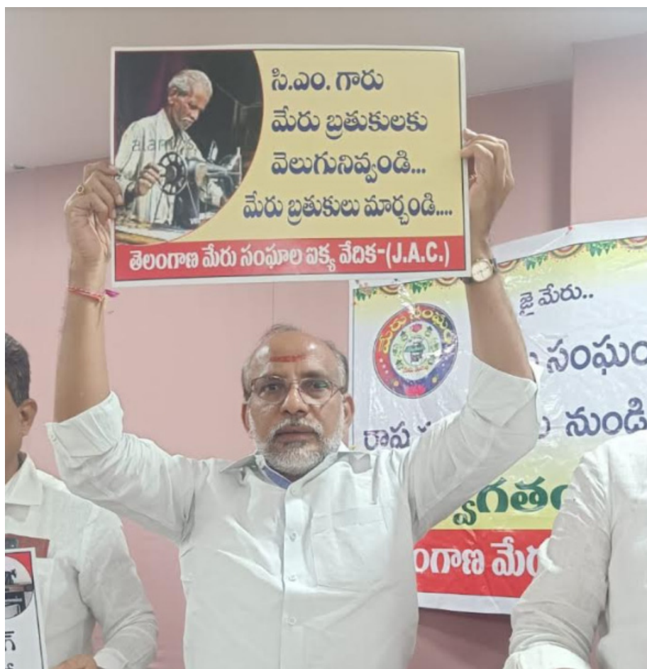
In a press conference at Bhashir Bagh press Club, JAC appealed to Hon'ble