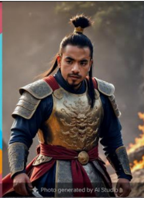
Photo generated by AI Studio