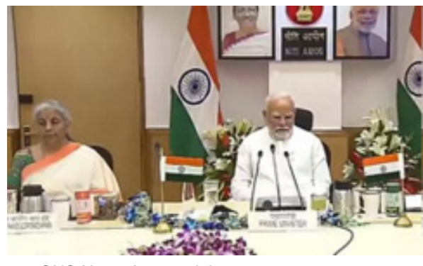
GNS News Agency, July 10

New Delhi: Prime Minister Narendra Modi on Thursday held a meeting with senior NITI Aayog officials and leading economists as part of the wider consultations in the run-up to the Union Budget 2024-25. The Modi 3.0 government will present its first full budget on July 23.