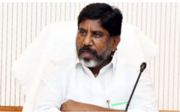
GNS News Agency, July 10

A Rythu Bharosa conference was organized in Utnoor of Adilabad district on Thursday under the auspices of the ministerial sub-committee to collect feedback on the procedures of the Rythu Bharosa scheme. Deputy CM Bhatti Vikramarka stated that Rythu Bharosa meetings are being held to gather everyone's views and that the government's decision will be based on the opinions of the farmers. During the workshop, Minister Tummala Nageswara Rao announced plans to construct the Pranahita-Chevella project at Thammidihatti and stated that the government is considering designing schemes for small farmers. Minister Ponguleti Srinivas Reddy emphasized the importance of discussing with the people and implementing the schemes, with the opinions collected being discussed in the assembly before a final decision is made.