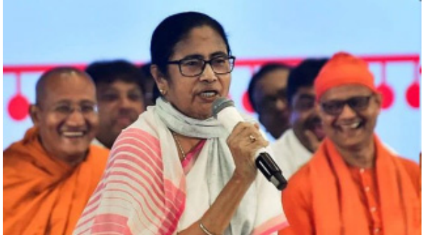
the meeting, following which the Budget was placed."Bengal and other opposition-ruled states were totally deprived in the Budget and were given step-motherly treatment," the CM said, adding that "this discrimination and political bias" will not be tolerated.

"When Parliament is in process, a minister is making statements to divide Bengal. And now from different sources, different party members are giving different types of statements - to divide Bihar, Jharkhand, Assam, and Bengal. We strongly condemn this attitude. To divide Bengal means to divide our country India. We don't support this" Banerjee said. This comes after Jharkhand BJP MP Nishikant Dubey proposed in the Parliament that certain parts of Bengal, Bihar and Jharkhand be made into a Union Territory.West Bengal BJP president Sukanta Majumdar and the Minister of State for Education also recently said that he had submitted a proposal to Prime Minister Narendra Modi, seeking to incorporate North Bengal in the North East states. Speaking to the media before leaving for Delhi, Banerjee said that the NITI Aayog asked to submit the written speech seven days before