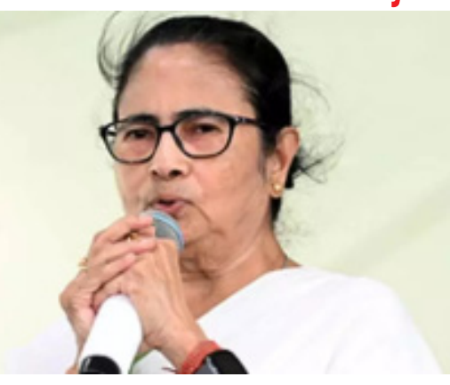
GNS News Agency, July 29

Kolkata: Chief Minister Mamata Banerjee on Monday said on the floor of the state Assembly that Trinamool Congress will resist all attempts to divide West Bengal."Let them come to divide Bengal. We will show them how to resist that," the Chief Minister said while addressing the sixth day of the monsoon session of the Assembly.