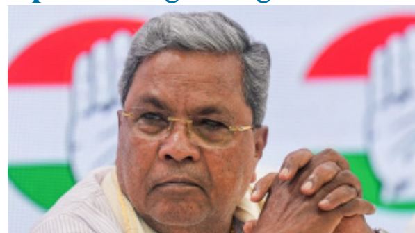
GNS News Agency, August 19