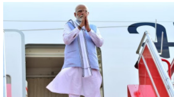
August 19