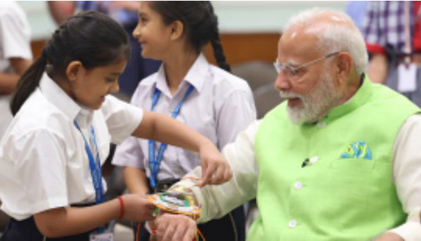
GNS News Agency, August 19

Prime Minister Narendra Modi celebrated Raksha Bandhan with schoolgirls in the national capital, where they tied rakhis on his wrist. Prime Minister Narendra Modi celebrated Raksha Bandhan with schoolgirls who tied rakhis on his wrist in the national capital on Monday. In a video, shared by the prime minister's office, the girls were seen tying rakhis to PM Modi, marking the festival of Raksha Bandhan. Earlier on Monday, the prime minister also extended his greetings on the occasion, praying for everyone's happiness and prosperity. "Best wishes to all countrymen on the occasion of Rakshabandhan, a festival symbolising the immense love between brother and sister. May this holy festival bring new sweetness in the relationships of all of you and happiness, prosperity and good fortune in life," PM Modi said in an X post.