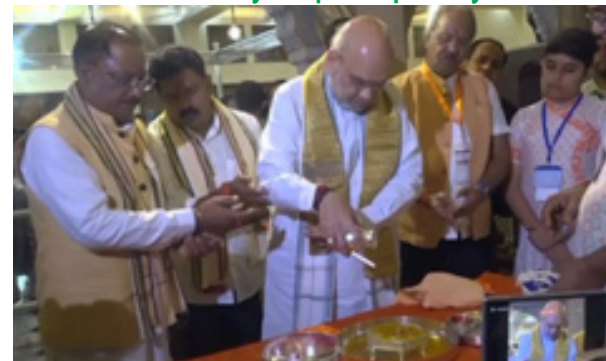
GNS News Agency, August 24

Raipur: Union Home Minister Amit Shah on Saturday offered prayers at Mahaprabhu Vallabhacharya temple and Champeshwar Mahadev in Chhattisgarh for the happiness and prosperity of the countrymen. He was accompanied by Chief Minister Vishnu Deo Sai, Deputy Chief Minister Vijay Sharma and MP Brijmohan Agarwal. The Union Home Minister was accorded a warm welcome and gifted the idol of Mahaprabhu Vallabhacharya. Vallabhacharya Nidhi Trust also welcomed Amit Shah and gifted him an idol of Shrinathji.