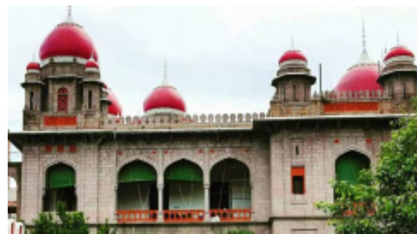
GNS News Agency, August 24

The Telangana High Court has intervened in the ongoing demolition case involving the N Convention Center, which is linked to popular Tollywood actor Nagarjuna. On Saturday, the court issued an interim order halting the demolition activities that were initiated by the Hyderabad authorities, known as HYDRA. This development comes after the Hyderabad authorities began a crackdown on illegal constructions in the Gandipet FTL and buffer zones, targeting unauthorized structures, including embankments. Reports surfaced alleging that the N Convention Center was built on land that encroaches upon Tammidi Cheruvu, leading to complaints and scrutiny from local residents. However, the demolitions had already taken place early Saturday morning as HYDRA completely razed the N Convention Center.