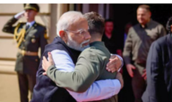
August 24

Kyiv: During his historic visit to Ukraine, Prime Minister Narendra Modi invited President Volodymyr Zelensky to visit India and the Ukrainian leader accepted the invitation. During his talks with Zelensky, PM Modi reaffirmed India's principled position and commitment to a peaceful settlement to the ongoing Russia-Ukraine conflict through dialogue and diplomacy. He also reiterated India's readiness to contribute in "all possible ways" to facilitate the speedy return of peace in the region.