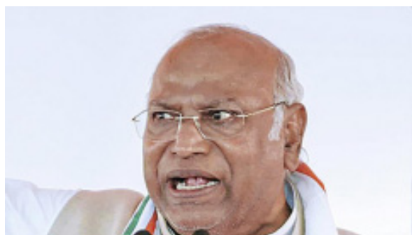
GNS News Agency, August 24

Marking the enactment day of Mahatma Gandhi National Rural Employment Guarantee Act, Congress president Mallikarjun Kharage criticised the Centre for its handling of the flagship programme alleging that the present state of the scheme is "a living monument of Prime Minister Narendra Modi's betrayal" of rural India. MNREGA was enacted by the Congress-led UPA government on August 23, 2005. The programme, he said, is facing multiple problems such as low wages, abysmal work days and deletion of job cards. "In the guise of using technology and AADHAAR, the Modi Govt has deleted over 7 crore workers' job cards, cutting these households off from MGNREGA work," he said in a post on X. He listed out other steps taken by the government that have impacted the scheme including low budgetary allocation. "This year's Budget allocation for MNREGA is just 1.78% of the total budgetary allocation, which marks a 10-year low in the scheme's funding. The lower allocation by the Modi government contributes to artificially suppressing the demand for work under the scheme," Mr. Kharage argued. The Economic Survey, Mr. Kharage said,