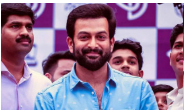
August 26

Kochi: Three-time Kerala State Film Best Actor award winner Prithviraj minced no words on Monday as he categorically sought a probe into the findings of the Hema Committee report on the conditions and sexual exploitation of women in the Malayalam film industry and "strong" action against the wrongdoers while observing that there have been lapses by the Association of Malayalam Movies Artistes (AMMA). "How it will affect, I do not know and if it has to affect, it should. There should be a proper probe into the report and if the allegations against someone are proven right, very strong action should be there and at the same time, if proven wrong, the same strong action should be made against those who raised it," he said. Hema Committee report: Vijayan govt left reeling as actor-turned-CPI-M MLA faces allegations, opposition steps up attack