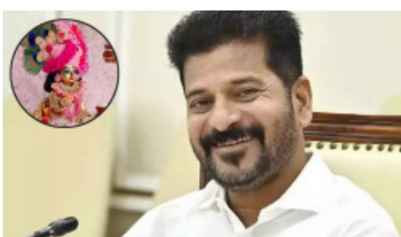
GNS News Agency, August 26

Chief Minister A. Revanth Reddy has extended his warm wishes to everyone in the state for Krishna Janmashtami. This festival celebrates the birth of Lord Krishna, a revered figure in Hinduism known for his teachings and divine actions. In his message, Chief Minister Revanth Reddy spoke about the importance of the 'Gita,' a sacred book written by Lord Krishna. He pointed out how the lessons from the 'Gita' are important for guiding people through all stages of life. According to him, the wisdom of Lord Krishna helps people live better and more meaningful lives.