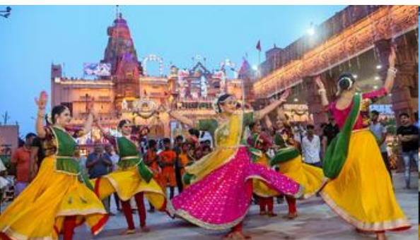
August 26

President Droupadi Murmu on Monday (August 26) extended greetings on the occasion of Janmashtami and said that we must imbibe the teachings of Lord Krishna and work for the nation's progress. In a post on X, President Murmu wrote, "I greet all my countrymen on the auspicious occasion of Janmashtami. This festival inspires us to be dedicated to the divine ideals of Lord Shri Krishna. On this occasion, let us imbibe the teachings of Lord Shri Krishna and pledge to work for the progress and prosperity of the country."