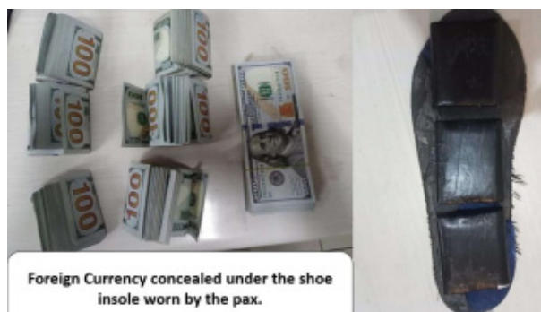
Foreign Currency concealed under the shoe insole worn by the pax.