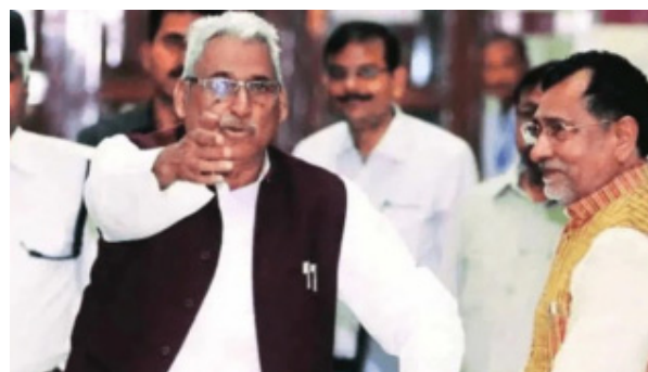
GNS News Agency, July 31