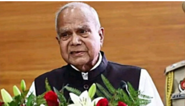
July 31

With Banwarilal Purohit's exit from the city as the Administrator, UT officers are now eagerly waiting for reversal of various key decisions taken by him. These decisions include ban on air travel to Delhi, the general housing scheme, and mandatorily meeting the public on fixed days with fixed hours. A key decision to impact the UT officers will be the lifting of the ban on air travel to Chandigarh and luxury stay of the officers in the national capital. As UT officers have to travel by train, this is one decision they are looking at. After a report by The Indian Express last year, Purohit had banned the air travel and luxury stay of officers going from Chandigarh to Delhi. While specifying that "officers should lead a simple life", the Administrator ordered that they will travel only by Shatabdi. He also ordered that they would stay only in state bhawans and not any luxury stay. The then Administrator who would even summon officials on the basis of