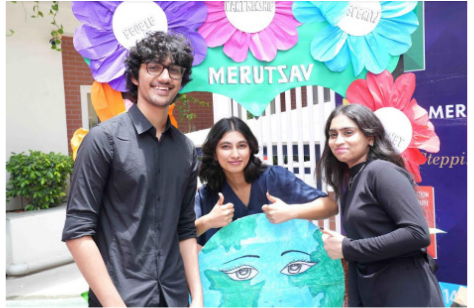
School and all other participating institutions, we look forward to continuing this tradition of excellence in sports and beyond.

The yoga competitions, known as "Mystic Yogis," displayed grace, flexibility, and mental focus, with winners and runners-up in the 5&6, 7&8, and 9-12 segments. Merutsav 2024 was a testament to the vibrant sports culture at Meru International School and the dedication of all participating schools. The event not only highlighted the athletic prowess of the students but also fostered a spirit of healthy competition and mutual respect. As we celebrate the successes of Meru International