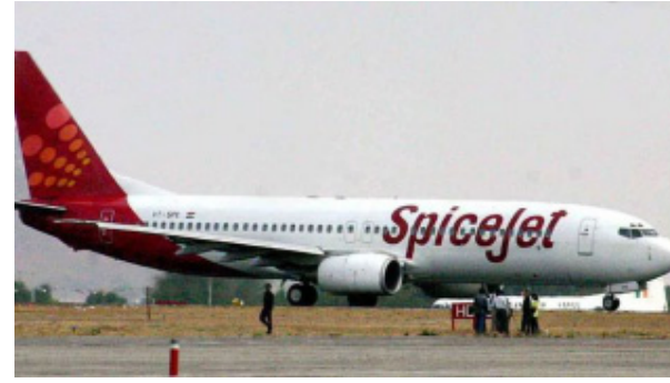
Sept 14

A division bench of the Delhi High Court on Wednesday refused to interfere with a single-judge bench decision where it had directed the grounding of three engines of SpiceJet, leased to it by two French companies. The bench, however, left SpiceJet's rights open to take all defences in the main suit action initiated by the two French companies: Team France and Sunbird France. SpiceJet had challenged a verdict by a single-judge bench on August 14, in which the court ruled in favour of the two French lessors and grounded three engines. The French companies instituted suits in December 2023 to obtain the repossession of three engines they had leased to the airlines after SpiceJet defaulted on payments.