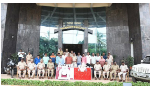
GNS News Agency, Sept 14

Two brothers who scoured Google Maps to locate lesser-known temples with limited security in north Karnataka and stole valuables from them were arrested on Tuesday, the Gadag district police said, adding that further investigation had revealed that the siblings had also murdered their elder brother a year ago. Eight temple theft cases and seven chain-snatching cases were solved and gold ornaments, cash and valuables worth Rs 46 lakh were seized following the arrests of the accused, the police said.