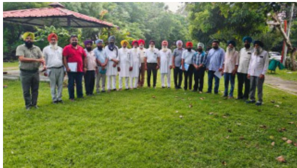
GNS News Agency, Sept 18