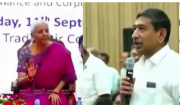
Sept 18