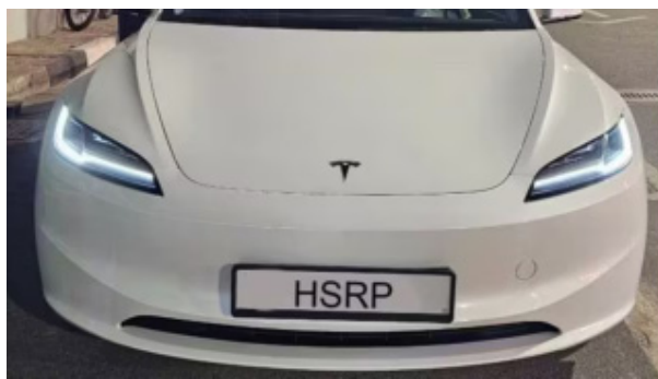
GNS News Agency, Sept 18