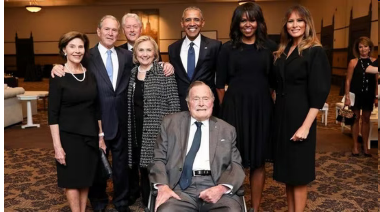
Sept 20