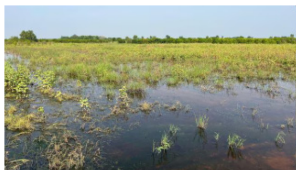
GNS News Agency, Sept 20

Around five villages in Punjab's Abohar are dealing with subsurface waterlogging, also known as "sem" in the local language. After the monsoons, saline water has surfaced in some areas of these villages, and it is present at a depth of 2-4 feet in large patches where either kinnow or cotton has been cultivated. The issue is serious in Patti Billa, Dalmirkhera, Sappanwali, Giddranwali, and Daulatpura in Abohar villages. Each of these villages has agricultural land ranging from 2,000 to 2,500 acres, where farmers cultivate cotton and kinnow. This time, they have also attempted to grow paddy. Sappanwali village is a nursery for government-approved kinnow saplings, while Daulatpura has most of its area dedicated to paddy cultivation. Water was seen at a depth of 8-10 feet about 8-10 years ago, and the level has gradually increased since then. Prem Kumar, a farmer of Patti Billa village, said, "For the past 3-4 years, we have been flagging the issue of the water level gradually rising. This time, the water has come up to the surface in many areas and is just below the surface in others. The saline water is not good for the soil, so we are worried about our ability to grow wheat in the coming season."