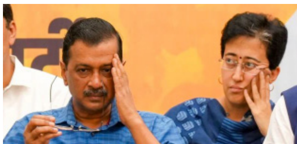
GNS News Agency, Sept 20

As Aam Aadmi Party (AAP) leader Atishi is set to replace Arvind Kejriwal as Delhi chief minister, former Congress MLA Haroon Yusuf on Tuesday criticised Kejriwal for misleading the public amid corruption allegations. Kejriwal resigned as Delhi chief minister after the Supreme Court granted him bail in the Delhi excise policy case. "A person who has come out after being accused in a corruption case is trying to confuse the people. While the CBI case was not valid, in the ED case, it was clearly mentioned that the chief minister could not go to the office or sign any papers. Yet, the party ignored this and claimed he was given a clean chit. If that were true, the court would not have imposed so many restrictions," he said.