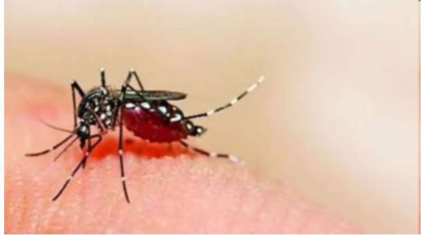
GNS News Agency, Sept 6

Karnataka dengue epidemic As of September 2, Bengaluru under Bruhat Bengaluru Mahanagara Palike (BBMP) tops the dengue fever chart with 11,590 positive cases and three deaths, followed by Mandya (872), Hassan (835), Mysuru (820), and Kalaburgi (793). The Karnataka Government on Tuesday declared dengue fever as an epidemic disease, in response to the increasing number of cases across the state. According to a gazette notification, the government will enforce stringent measures to control the spread of dengue fever, which has been identified as a significant public health concern.