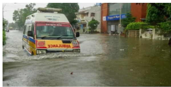
GNS News Agency, Sept 6

Gujarat's Morbi, Dwarka, and Jamnagar recorded rainfall levels that surpassed their 50-year return periods (with Dwarka exceeding 100 years), marking an intensity of rainfall that typically occurs only once in half a century. A return period is a statistical measure indicating the average interval between such intense events. "However, the flooding was likely exacerbated by extensive urban development in flood-prone areas, altered elevations, and drainage patterns compromised due to rapid urbanization and clogged drainage systems," said Udit Bhatia, assistant professor in civil engineering, computer science, and engineering at IIT Gandhinagar and Principal Investigator of the MIR Lab, who works on the resilience of urban systems to extreme events.