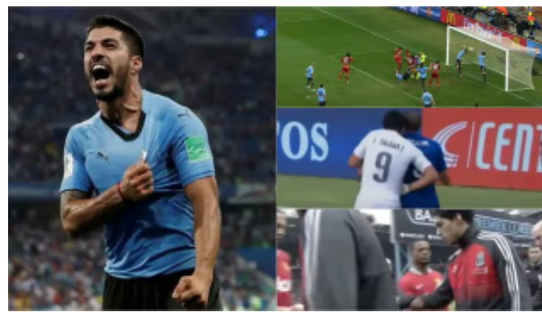
Sept 6

Luis Suarez retirement controversies Luis Suarez's career is riddle with controversy with the Ghana handball incident, the Patrice Evra racism incident and biting opponents just the tip of the iceberg. Luis Suarez, one of the most prolific and controversial strikers in world football announced international his retirement at 37 years of age, revealing that his 17-year-long career will end after the World Cup qualifier against Paraguay at Centenario Stadium on Friday "It hurts to say it, but Friday will be my last match with my country's national team. I am retiring because I want to step aside. I am 37 years old, there are a lot of talented players, and I know it would be difficult to get to the next World Cup. It is comforting to know I can retire on my terms and not have to retire due to injuries, or to not being called up. I want to say goodbye here, with my people. This is the ideal moment," he said at a press conference on Monday.