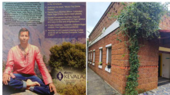
Sept 6