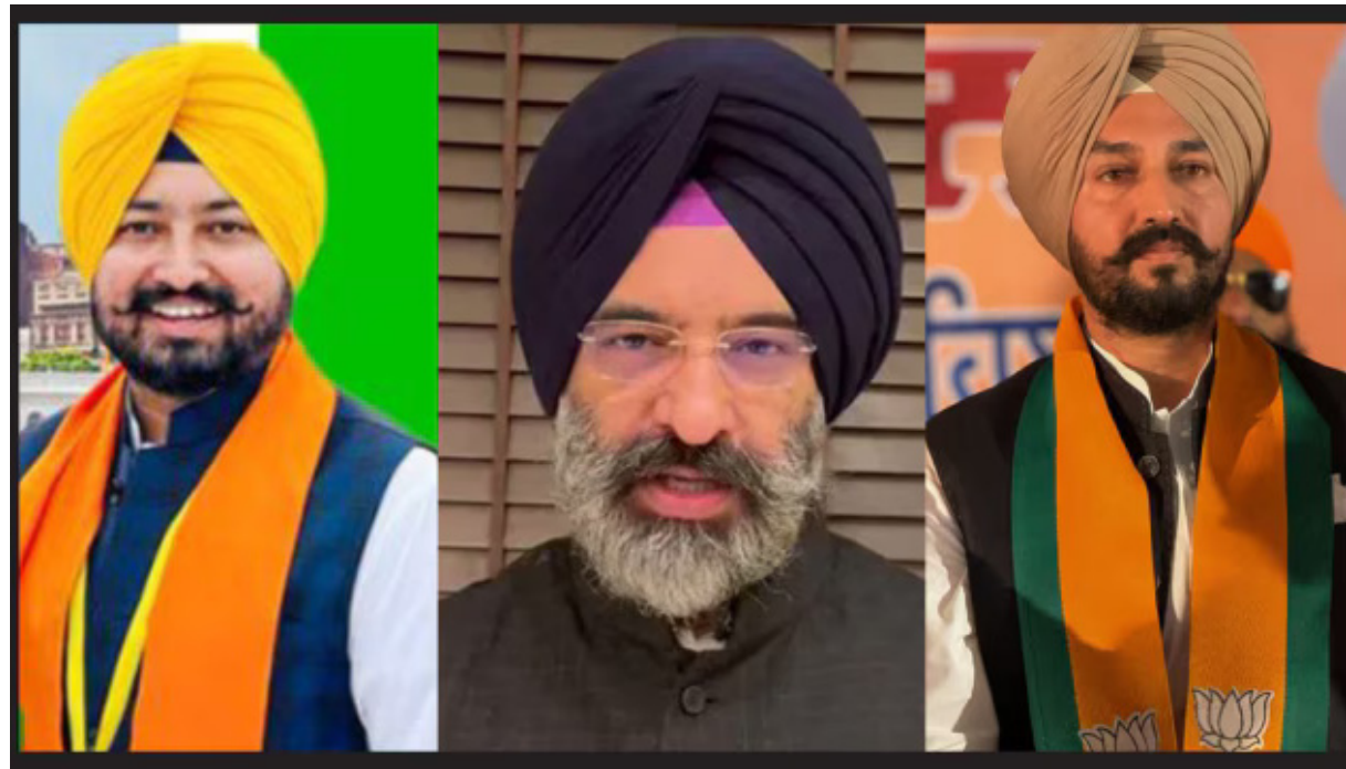
GNS News Agency, Sept 8