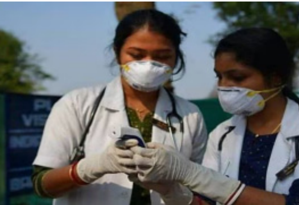
GNS News Agency, Sept 8

Out of 14 applications for new medical colleges in Maharashtra, including ten government-run and four private colleges or deemed universities, only two have received NMC nod. (File Photo) Out of 14 applications for new medical colleges in Maharashtra, including ten government-run and four private colleges or deemed universities, only two have received NMC nod. Although the Maharashtra government had assured to add close to 1,000 seats at government medical colleges across the state, only 50 have been approved by the National Medical Council (NMC) for admissions in the academic year 2024-25. According to candidates, that is hardly any relief.