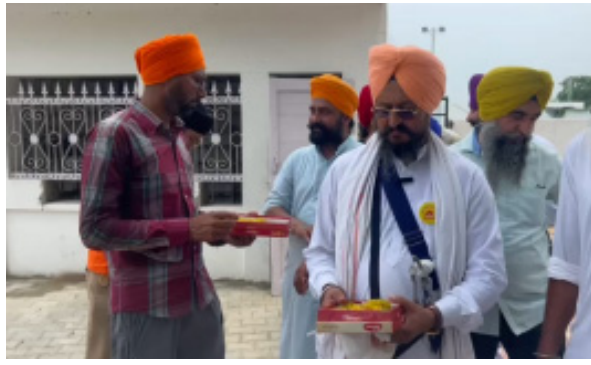
GNS News Agency, Sept 8