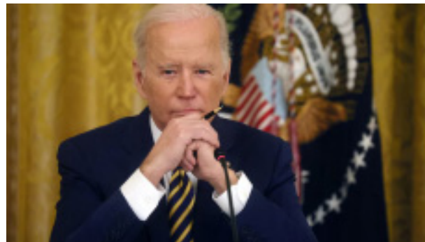
GNS News Agency, Sept 8

US President Joe Biden is not being treated for Parkinson's disease, the White House said on Monday, after the New York Times reported that visitor logs showed a doctor specialising in the illness visited the White House at least eight times from August through March. Concerns that the president might be suffering from an undisclosed illness have risen since Biden stumbled, appearing frail and losing his train of thought at times, in his June 27 debate against Republican Donald Trump.