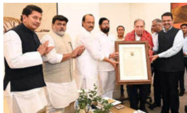
GNS News Agency, Oct 10

Mumbai: The Maharashtra Cabinet chaired by Chief Minister Eknath Shinde on Thursday on behalf of all citizens of Maharashtra paid tributes to veteran industrialist, Tata Sons' Emeritus Chairman Padma Vibhushan Ratan Tata and passed a resolution condoling his death. The Cabinet unanimously passed a resolution to appeal to the Centre to honour Ratan Tata with the prestigious Bharat Ratna award. "Entrepreneurship is also an effective way of building society. The country can be taken forward only by the establishment of new industries, but for that, one needs true patriotism in the heart and equally sincere concern for our society. "We have lost a social worker, visionary and patriotic leader in Ratan Tata. His contribution was phenomenal. He was the son of Maharashtra. India was proud of him. He made his and India's mark internationally, passing rigorous tests by observing self-discipline, clean administration and high moral values in running large enterprises," says the resolution.