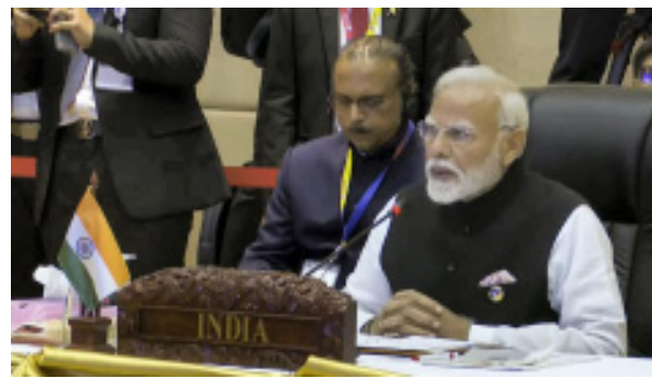
tion and momentum to the historic ties between India and ASEAN nations.

Prime Minister Narendra Modi on Thursday (October 10, 2024) said India-ASEAN friendship was very important at a time when parts of the world were facing conflicts and tensions. Addressing the 21st India-ASEAN Summit in Vientiane, Laos, Mr. Modi also said he had announced the Act East Policy 10 years ago and in the past decade it had given new energy, direc-