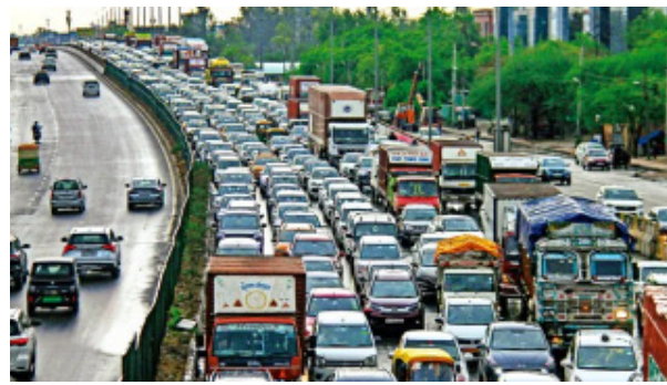
GNS News Agency, Oct 10

With the undesirable combination of Delhi winter and pollution-filled days fast approaching, Delhiites will witness a fresh round of crackdown on diesel and petrol-fuelled vehicles that have completed 10 years and 15 years of age. The enforcement team, including the Delhi Traffic Police, Enforcement Wing of the transport department, Municipal Corporation of Delhi (MCD), and the New Delhi Municipal Council (NDMC), will start the drive before Diwali if pollution increases, a transport official said.