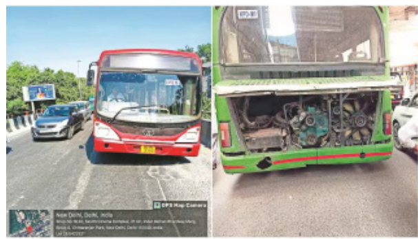
GNS News Agency, Oct 10

On Tuesday, a message was shared on the Delhi Traffic Police X handle at 2.23 pm: "Traffic is affected on Outer Ring Road in the carriageway from Nehru Place towards Savitri flyover due to breakdown of a bus on Savitri flyover. Commuters are advised to plan their journey accordingly." At 3.48 pm, a follow-up post read: "Bus has been removed." At 11.01 am, a similar post was shared of a bus breaking down at Sarita Vihar flyover loop. At 10.51 am was yet another post of a bus breakdown — this time, near Dwarka Mor Metro Station. These were among 23 breakdowns that disrupted traffic since last Friday, going by the Traffic Police's social media posts. To improve response time to bus breakdowns, the Traffic Police and the Delhi Transport Corporation have now created a common WhatsApp group to share live updates, police sources said. The move is significant, going by the number of DTC bus breakdowns that happen on Delhi roads daily. According to Delhi Traffic Police's X handle, eight breakdowns disrupted traffic just on Monday. Four were reported on Tuesday. Additional CP (Traffic) Dinesh Kumar said, "The group comprises the Transport Department Commissioner, Delhi Traffic ACPs, and all other senior officials from the two units. It has been made to increase coordination between the