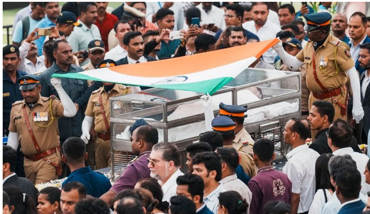
Oct 10 Industry titan Ratan Tata's last rites were performed with full state honours at the

Worli crematorium in Mumbai on Thursday evening. Earlier, Tata was given a ceremonial guard of