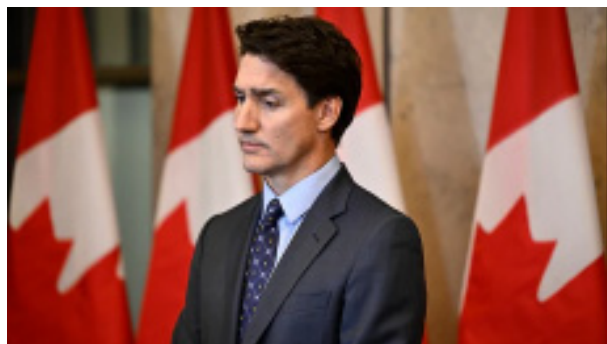
GNS News Agency, Oct 17

Imran Khan, as the Prime Minister of Pakistan, promised to create a "naya Pakistan" (new Pakistan). From his jail cell, he can have the cold comfort that a new Pakistan has emerged, albeit on the American continent. Harboured wanted terrorists, resorting to unwarranted blame games, and playing vote-bank politics detrimental to its own country's security, Canada under Prime Minister Justin Trudeau has shown all the hallmarks of Pakistan. And with Monday's recalling of the Indian envoy, and expulsion of Canadian envoys, New Delhi has officially put Canada in the same bracket as Pakistan. "Canada has become the new Pakistan for India," Sushant Sareen, Senior Fellow, Observer Research Foundation, observed during a panel discussion on India Today TV. Sareen was referring to the tit-for-tat expulsions of diplomatic staff by India and Pakistan and the harbouring of terrorists by the Islamic country. That Canada under Justin Trudeau has emerged as the new Pakistan has been echoed by several commentators, including Michael Kugelman, Abhijit Iyer-Mitra and Amish Tripathi.