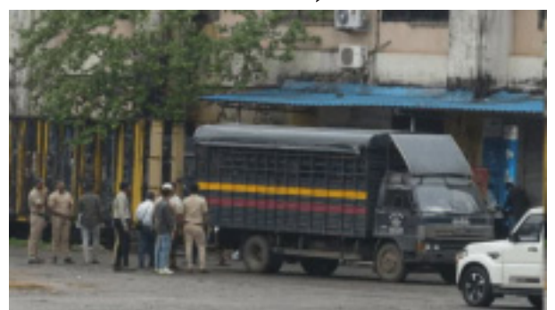
GNS News Agency, Oct 1

The Maharashtra government on Friday told the Bombay High Court that its police department is taking steps to identify a place for the burial of the deceased accused in the Badlapur sexual assault case. The state lawyer also stated that two police officers were deployed outside the house of the deceased accused to avoid any untoward situation in light of his father's claims that the family had received threats.