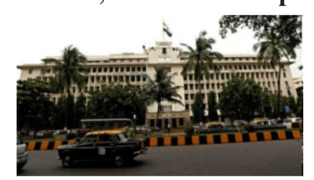
GNS News Agency,Oct 1

An unknown woman on Thursday trespassed into the sixth floor of Maharashtra's secretariat, and attempted to vandalise the office of Deputy Chief Minister Devendra Fadnavis, the Mumbai police said. According to the police, the woman created a ruckus, removed the name plate of Fadnavis in his office, broke the potted plants near the cabin around 7 pm and escaped from the building. The incident, the video of which went viral on social media, has raised security concerns in the Secretariat with the police still struggling to identify and trace the woman. The CCTV footage shows the woman expressing outrage outside the high security cabin of Fadnavis in the state government's headquarters in Mumbai. She is seen hurling objects in the lobby in protest against the deputy CM, said the Marine Drive police on Friday. Meanwhile, Fadnavis said the police are trying to identify the woman and address her concerns. "We will try to understand why the woman was upset. The government headquarters Mantralaya doors are always open for common persons. They walk in and out daily with their problems seeking solutions," he told reporters in Shirdi.