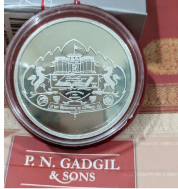
Oct 30