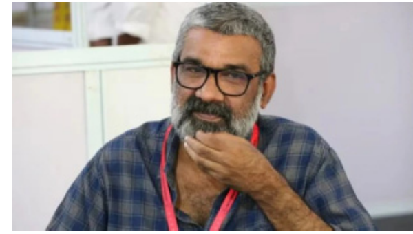
GNS News Agency, Oct 30

Malayalam director Ranjith, Kerala Police register case against director Ranjith over sexual misconduct allegation Malayalam film director Ranjith. The Bengaluru police have booked Malayalam film director Ranjith Balakrishnan on charges of sexually assaulting a man. The case was initially registered in Kerala but transferred to the Karnataka capital as the complainant, a 31-year-old artist, claimed the incident took place in a hotel in the city. The FIR has been registered at the BIAL police station under section 377 (unnatural offences) of the Indian Penal Code and 66 E (violation of privacy) of the Information Technology Act.