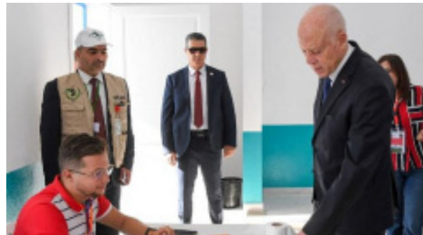
GNS News Agency, Oct 8