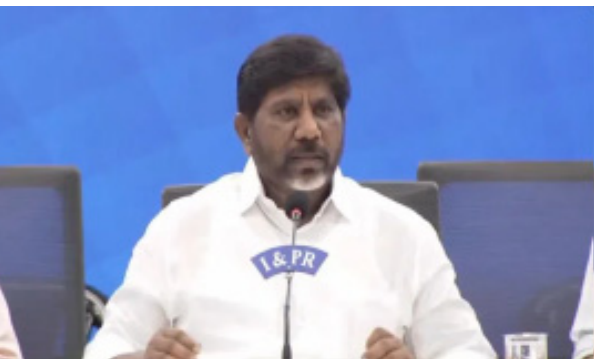
GNS News Agency, Oct 8

Hyderabad: A day after Deputy Chief Minister Mallu Bhatti Vikramarka made a presentation on encroachments of water bodies in the capital region since 2014, social media has been abuzz with discussions and observations with many opining that the report cited in the presentation was creating panic among the public, apart from many expressing doubts over extortion attempts and the same impacting Hyderabad's brand image. The discussions are revolving around several major projects that purportedly fall under different lake FTL limits, and whether the government would initiate action against them, and also, what the impact of any such action would be on Hyderabad's real estate sector, which is already facing a slump.