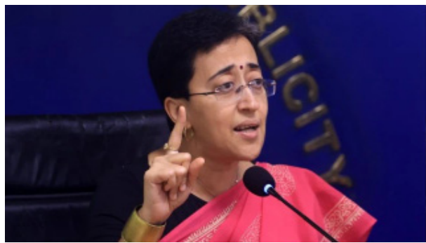
GNS News Agency, Dec 2

Ayushman Bharat Atishi on Thursday had also said that the AAP government has been ready to implement Ayushman Bharat in-principle, but was facing problems due to the "contradictions between the Centre's and Delhi health welfare schemes" A meeting that took place nearly two weeks ago between Chief Minister Atishi, Health Minister Saurabh Bharadwaj and Health department officials - where data presented showed significant expenditure cuts for Delhi government if it were to adopt the Centre's Ayushman Bharat insurance scheme - is when the AAP government first softened its stance against the Union government-run scheme, sources have told The Indian Express. Atishi said that officials have been directed to find a way to adopt the central scheme while ensuring that the Delhi government's own universal free healthcare scheme is not impacted. Another reason behind the change of heart, sources said, was the recent inclusion of all those above the age of 70 getting universal coverage under the Ayushman Bharat scheme. "The health department has been sending files regarding the implementation of the Ayushman Bharat scheme to the minister for the last one year. But it went unheard for the last one year," said a senior official.