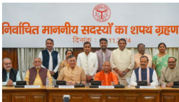
Dec 2