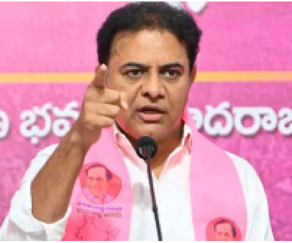
GNS News Agency, Dec 4