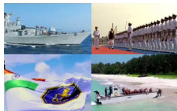
GNS News Agency, Dec 4