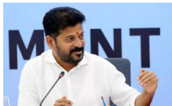
GNS News Agency, Dec 6

Hyderabad: Chief Minister Revanth Reddy announced initiatives to address the growing challenges of pollution and traffic congestion in the city. Highlighting