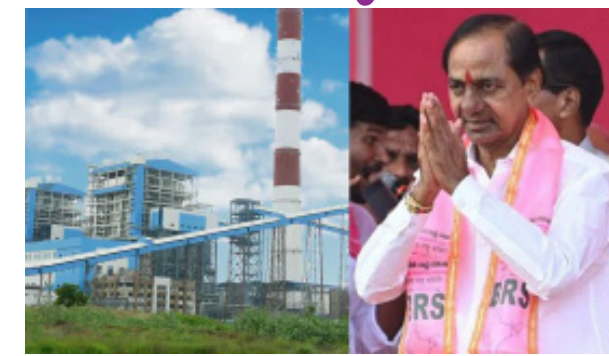
GNS News Agency, Dec 6

Hyderabad: With the 4,000 MW Yadadri Thermal Power Station (YTPS) all set to begin operations on Saturday, marking a milestone in the State's journey toward energy independence, BRS working president KT Rama Rao termed the project a testament to party president and former