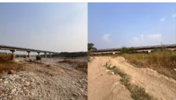
GNS News Agency, Dec 8

Sand mining, a lucrative industry worth crores of rupees, has become a significant problem for residents of at least 200 villages in Ropar and Garhshankar in Punjab. The Kalwa-Nangal bridge over the Swan river, located in Algran village and connecting Ropar to Garhshankar, has been damaged since July 2023 due to the overexploitation of the river bed for sand. Despite the outcry over the bridge's condition, sand mining continues unchecked even as residents are forced to take a 30-km detour because the Punjab Mandi Board lacks the funds necessary to carry out the repairs. The bridge has been closed to traffic since December 21, 2023. As residents have reported, the bridge was opened for traffic in 2002 and has witnessed illegal sand mining activities since 2006. Crushers operating in the area ran all night and this overexploitation of the riverbed for sand mining damaged the bridge's pillars which were further compromised by the floods in 2023.