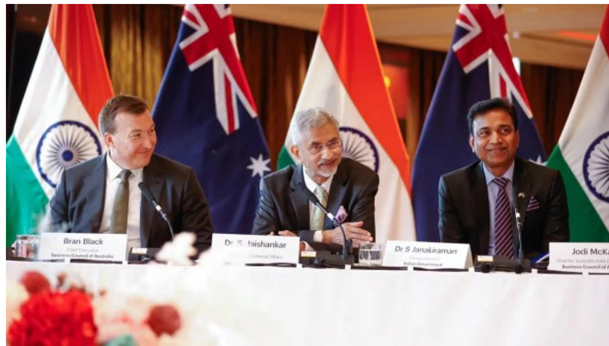
GNS News Agency, Dec 8