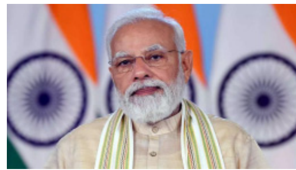
GNS News Agency, Dec 14

New Delhi: Calling India the "Mother of Democracy", Prime Minister Narendra Modi on Saturday said the Constitution is the foundation of the country's unity. Speaking on the second day of debate on 75 years of the Constitution's adoption, PM Modi cited remarks by Dr B.R. Ambedkar highlighting the importance of collective decision-making for nurturing a feeling of unity. "I am pained to say that after Independence, due to vested interest, there was an attack on the basic character of the country that celebrated unity in diversity. Making unity in diversity a part of our lives will be the biggest tribute to Dr Ambedkar," the Prime Minister said while speaking in the Lok Sabha.