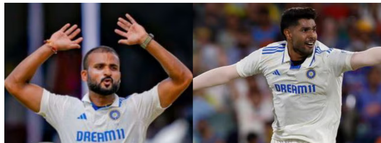
GNS News Agency, Dec 14

"Mate, the Indian team bus is going to pull up anytime, soon, all ready?" A man with a walkie-talkie asks a security guard near an entrance to the Gabba. It's around 8:45 am on Thursday. "Not many fans here as yet," wonders the guard, and the walkie-talkie man smiles, "good for us, isn't it!". Across the road from them, a controversial train station is being constructed. An underground rail tunnel has already been built. There is no scaffolding to block it. None is needed either as no dust swirls up from the site, unlike in India. "Dust? Oh we sprinkle some chemical stuff into the water, and spray it on the site every morning. The dust doesn't lift," says a construction worker, out for a smoke. The station was intended for the 2032 Olympics in Brisbane, and the Gabba was supposed to be pulled down and rebuilt according to the needs for that global event. But that $ 2.7 billion dollar rebuilding plan is now on hold as Gabba has proved an architectural nightmare. It's almost sandwiched amidst a cluster of buildings that surround it and there is a school nearby. The entire arena's footprint doesn't apparently match Olympic requirements. A review is on.