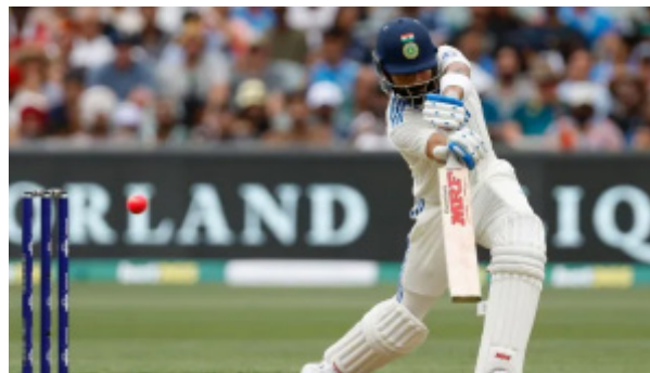
GNS News Agency, Dec 14

Often, the balls were at him even when he was on the move forward. It seemed to annoy him, and he would shake his head or mutter something when the ball caught the edge.