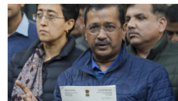
Dec 14

Former Delhi Chief Minister and AAP convener Arvind Kejriwal has written a letter to Union Home Minister Amit Shah requesting a meeting to discuss concerns regarding law and order in Delhi. The AAP convener has raised concerns and pointed out that despite Delhi's law and order being under the central government's control, the city is increasingly being recognized as the "crime capital" across the country India and abroad. He cited worrying statistics, including Delhi's top ranking in crimes against women and murder cases among 19 major metro cities in India. Additionally, Mr. Kejriwal noted the rise in extortion gangs, bomb threats at airports and schools, and a significant 350% increase in drug-related crimes, all of which have contributed to growing security concerns among residents. In a letter to Home Minister Amit Shah, Mr. Kejriwal wrote, "Delhi's law and order is under the Central Government, but Delhi is now being known as the capital of crime." "Delhi ranks number one in crimes against women among 19 metro cities of India, Delhi ranks number one in murder cases and extortion gangs are active across the city," said Mr. Kejriwal. He further said that Delhi is now being recognized as the crime capital in the country and abroad. Earlier this week, Mr. Kejriwal