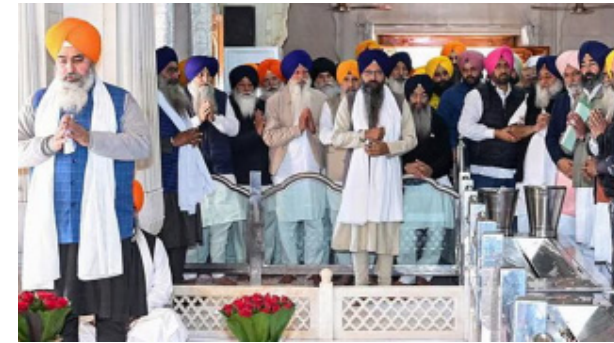
GNS News Agency, Dec 16