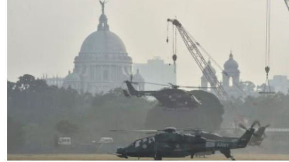
Dec 16

A small delegation of 10-12 people from Bangladesh is set to grace the upcoming Vijay Diwas (Victory Day) celebrations in Kolkata on Monday, amidst tensions between India and Bangladesh. The delegation is expected to include both freedom fighters who played a crucial role in the 1971 Liberation War and serving officers of the Bangladesh Armed Forces. As per sources, Mukti Yoddhas are likely to arrive in Kolkata one day before the Vijay Diwas. For the past five decades, India has invited Mukti Yoddhas — members of the Mukti Bahini, the Bangladeshi guerrilla resistance force that fought alongside Indian forces in the 1971 war — to participate in the celebrations. This year, despite initial un-