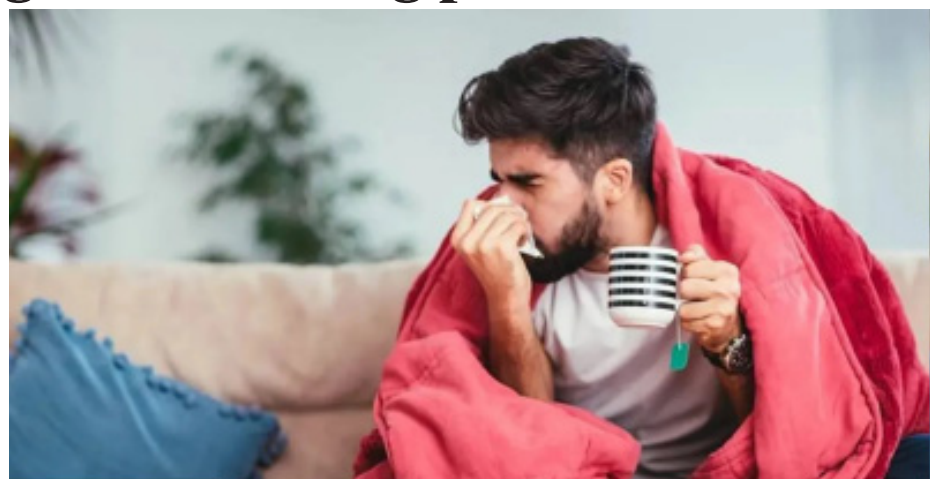
Dr Mittal said risk factors include poor nutrition, lack of sleep, exposure to air pollutants, and viral infections. Walking pneumonia commonly affects individuals with stronger immune systems, so it often manifests with milder symptoms.

Walking pneumonia is a less severe type of pneumonia characterised by a localised infection in the lungs. Unlike typical pneumonia, patients with walking pneumonia usually don't need hospital care and may continue with daily activities despite mild discomfort. According to Dr Mittal, common symptoms include a low-grade fever, persistent cough, slight sputum production, and occasional shortness of breath. Blood pressure, pulse rate, and oxygen levels generally remain stable, setting it apart from more intense cases of pneumonia. A white patch on a chest X-ray often identifies