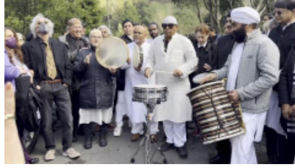
Tabla maestro Zakir Hussain laid to rest in San Francisco, percussionist Sivamani pays musical tribute

Brief Scores: C Division One-Day League: Ameerpet 250/6 in 40 overs (Parmeet 102 no, Sukhbeer 44, Aditya 4/46) bt SK Blues 237/8 in 40 overs (Anshul 46, Manpreeth 3/35); Reliance 296/3 in 50 overs (Pranay 77, Shanmukh 106 no) bt Raju CA 112 in 34.3 overs (Prathamesh 3/33, Arya 5/21); Superstars 165 in 34.1 overs (Karthik 65, Jai Keerth 5/28) lost to VP Willowmen 166/6 in 31.3 overs (Akhileshwar 48); U-14 Boys One-Day Knockout Tournament: World One School 96 in 29.2 overs (Anshul 51, Anas 4/26) lost to Adilabad Dist 107/3 in 20.3 overs;