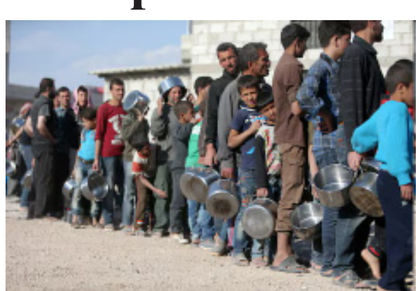
look at foreign aid.

this month on his social media platform, X, that DOGF would