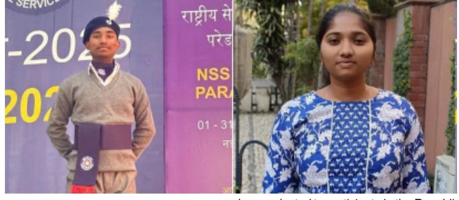
Hyderabad: Two NSS student volunteers of the Government City College have