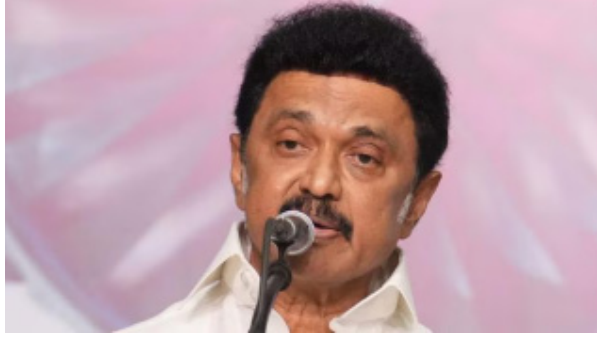
GNS News Agency, Jan 17

CM StalinCM Stalin greeted people and party workers on the occasion of Pongal, the first day of auspicious Tamil month 'Thai' which falls on January 14 and urged them to celebrate it with vigour, saying the festival signified unity. Notwithstanding the Centre 'ignoring' Tamil Nadu and political rivals trying to create rumours about the ruling dispensation, the DMK-led government was delivering efficient administration and the people of the state were therefore inclined to vote for the party once again in next year's elections, Chief Minister M K Stalin said