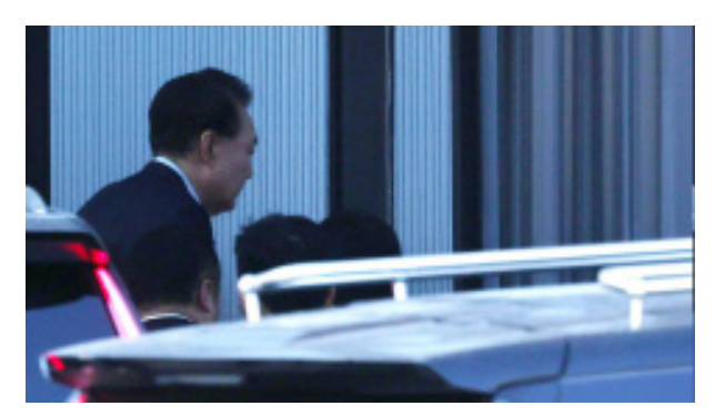
preparations and the concernsSouth Korea's acting leader, Deputy Prime Minister Choi Sang-mok, issued a statement early Wednesday urging law enforcement and the presi-

The Corruption Investigation Office for High-Ranking