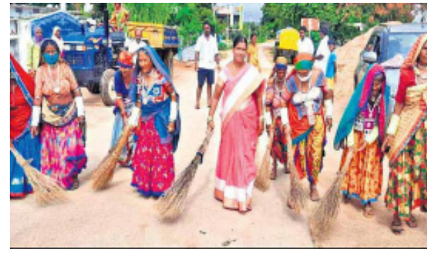
protests demanding the State government to clear the pending bills. One such protest was staged on Friday and as a symbolic gesture, representations were submitted to Mahatma Gandhi statues across the State by the former Sarpanches.

As part of the programme, nurseries were set up, segregation of dry and wet waste and manufacturing of vermicompost through waste was taken up, Palle Prakruthi Vanams and crematoriums were also established in the villages. All these initiatives aided in comprehensive devel opment of villages and special focus was laid on hygiene. The Palle Pragathi programme helped in reaping a rich haul of awards for the State. In 2022, as many as 19 villages had bagged the national panchayat awards in the annual awards announced by the union Ministry of Rural Development. In the National Panchayat Awards 2024, only Chillapalli gram panchayat won the Deen Dayal Upadhyay Panchayat Satat Vikas Puraskar from the State.Congress government launches Swacchadanam – Pacchadanam The Congress government had sidelined the Palle Pragathi programme and launched the "Swacchadanam -Pacchadanam" programme.Further, the term of Sarpanches ended in January this year. Since February Special Officers have been appointed by the government and entrusted with the task of gram panchayats functions. But, the conditions in villages have changed a lot. According to an office bearer of Telangana Sarpanches Association Joint Action Committee, many panchayats were finding it difficult to execute basic works, including sanitation, watering to saplings, besides payment of salaries to staff.Since last one year, the former Sarpanches have been staging