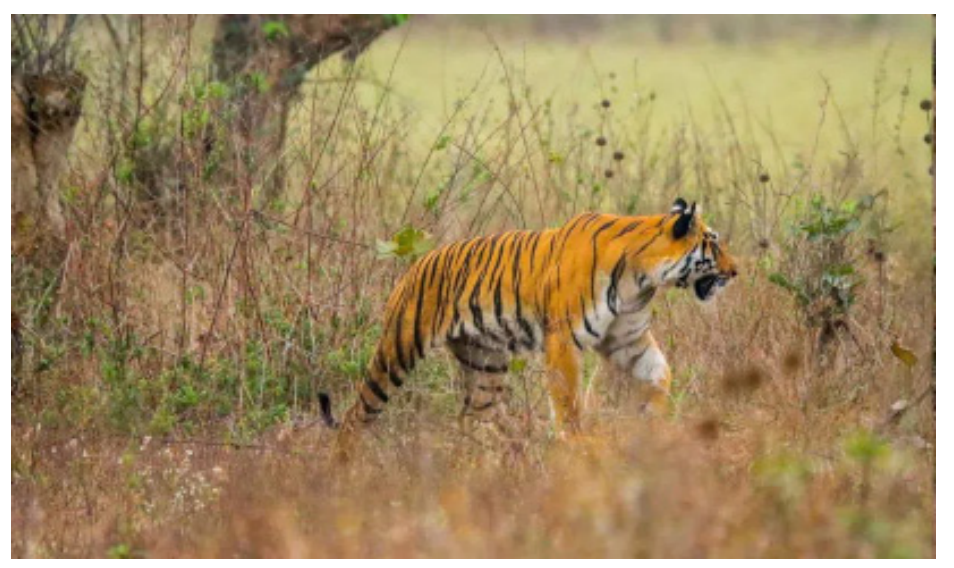
The land was converted into a plantation of tree species. Around 40 tree species were grown in the land, attracting tigers of

tigers are going futile owing to solely this problem," a senior forest official regretted. The officials said that the non-tribals including backward communities, scheduled castes and certain privileged castes were indulging in the encroachment of the forest cover for agriculture. Members of these communities own somewhere between 5 and 20 acres in certain parts. A non-tribal man has 70 acres of land, while another occupies 30 acres in Kagaznagar division alone. The forest officials are creating awareness among the villagers over the need to protect the wild animals. They are requesting the rural folks not to occupy forest lands. They are digging trenches to prevent encroachment of forest lands. However, the forest cover is being encroached upon by mostly non-tribals. The officials remain helpless even as the precious cover is lost, resulting in migration of tigers to surrounding landscapes in search of territory. The officials managed to reclaim 1,000 acres of forest land near Itukalapahad village in Sirpur (T) mandal a few years ago.