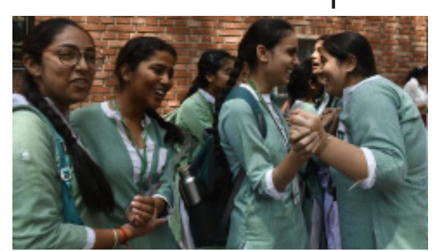
GNS News Agency, Feb 6

There are 71 lakh women voters in Delhi, which is nearly half of the total electorate. Further, women have a high turnout rate as well. So, it is no surprise that all contesting parties provide incentives tailored towards women. These incentives then come to light through the budget. Over the last decade, the overall budget for Delhi has increased from 271 billion to 760 billion. But, how much of this budget is reserved for women?