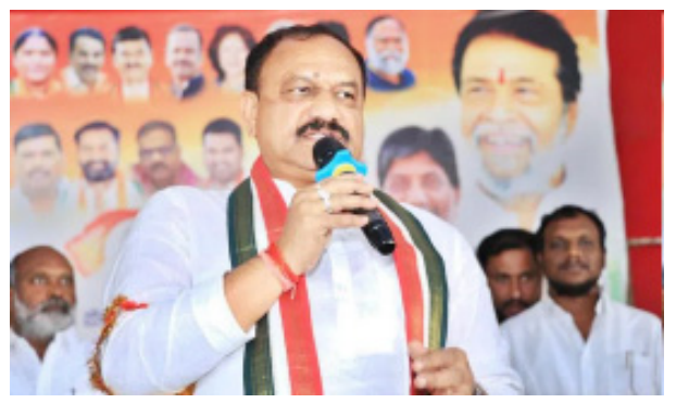
Feb 6