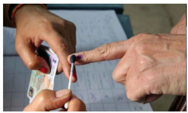
GNS News Agency, Feb 6

Hyderabad: The countdown for local body elections in Telangana has begun, with the State government expediting preparations to conduct Panchayat Raj elections. However, the implementation of 42 per cent reservations for the Backward Classes (BCs), will now solely depend on the discretion of the political parties, as it reguires constitutional amendment which is a prerogative of the BJP-led Central government.