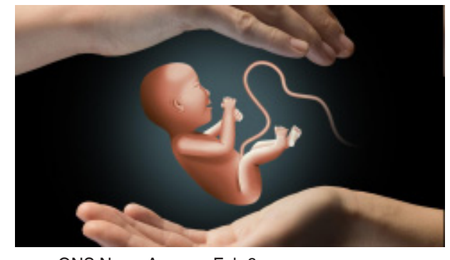
Feb 6

A rare 'foetus in foetu' case came to light in Maharashtra's Buldhana district, where a foetus-like mass was located within the body of an eight-month-old foetus, the Buldhana medical official said on Friday, January 31, 2025.